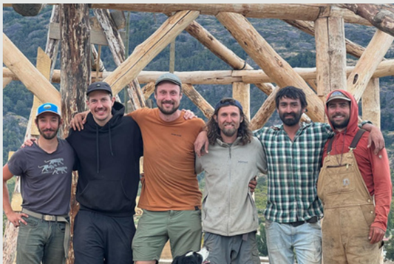
From gathering 350kg of community-donated wool to constructing an eco-friendly classroom and celebrating with our builders, the Alma Verde team embodies the principles of bioconstruction and community support.