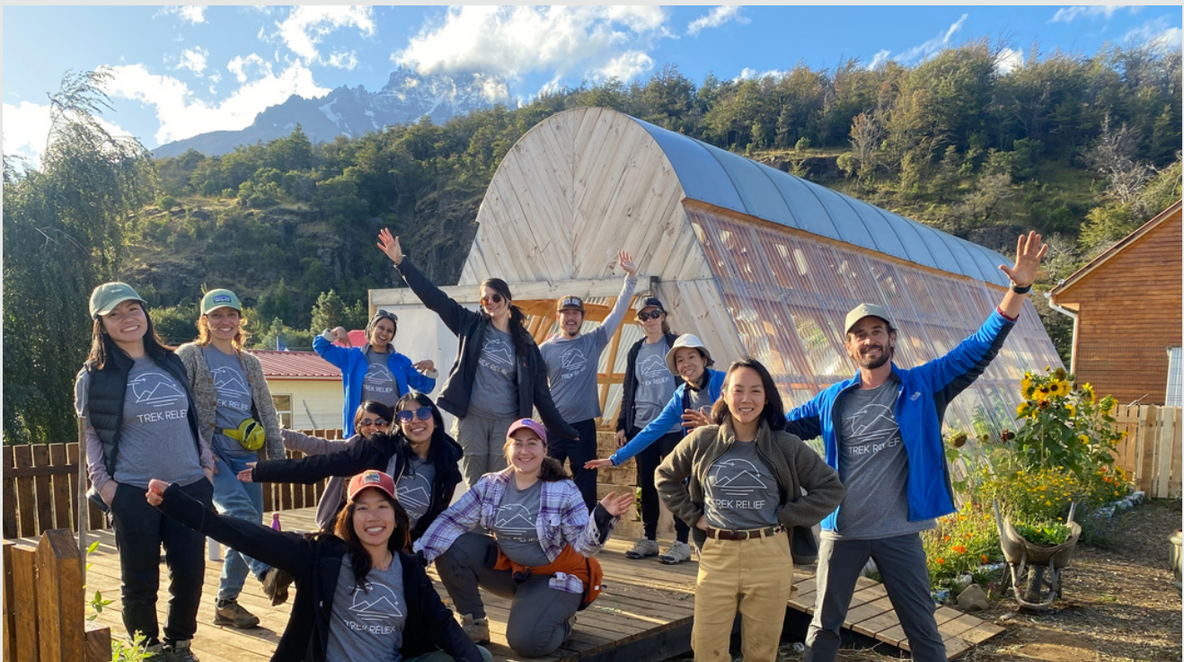
After two days of improving the greenhouse, caring for the garden, and hosting workshops with students and the local community, our Patagonia trekkers are excited to present Trek Relief's sustainability project in Patagonia. March 2023.