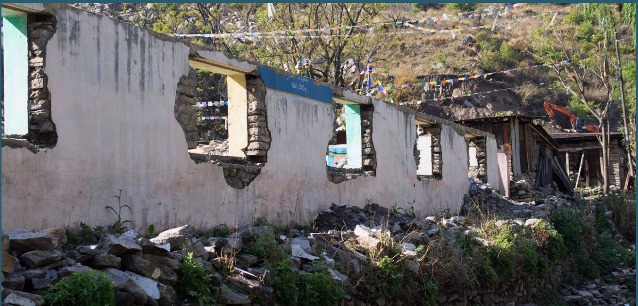
Before the transformation: a glimpse of our school in Nepal, standing quietly, ready for the journey of rebuilding and revival.