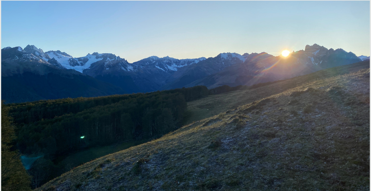
On our second day of our trek in Patagonia, a radiant sunrise over private lands near the Patagonia National Park promised a day of adventure and connection in nature. March 2023.