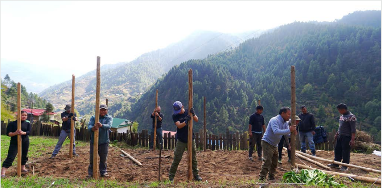
Our Nepal trekkers and local Solukhumbu community members join hands over three transformative days to construct greenhouses in the lower Everest region, fostering growth and unity in every frame. November 2023.