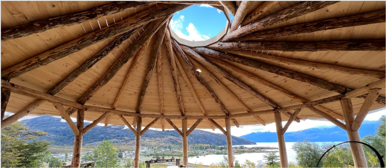
The innovative reciprocal roof—to be insulated by sheep's wool and topped with living grass and plants—is a testament to the power of natural geometry and human-powered bioconstruction, and showcases how sustainability and architecture can merge.

Trek Relief has been supporting Alma Verde through fiscal sponsorship in building the Free School of Permaculture, a beacon for sustainable living and ecological education.